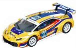
Lamborghini Huracan GT3