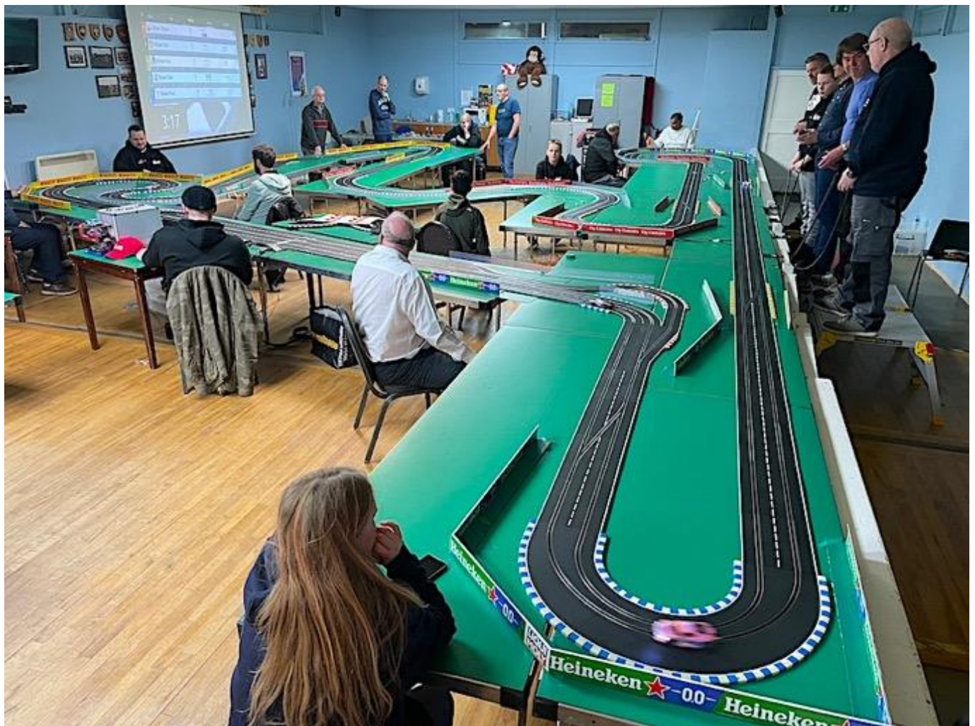
The full 157'4" Shanghai F1 GP circuit had a bit of everything.