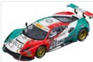
Ferrari 488 GT3 Squadra Corse Garage Italia No.7