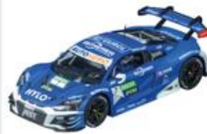
Audi R8 LMS GT3 Evo II Team ABT Sportsline No.7