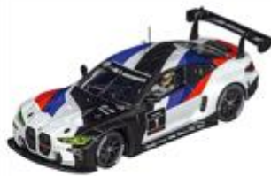
BMW M4 GT3 BMW M Motorsport 2021 No 1