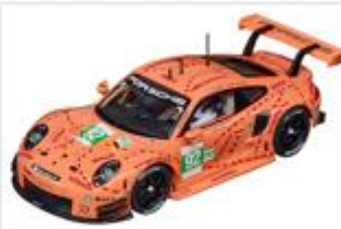
Porsche 911 RSR No.92 "Pink Pig"