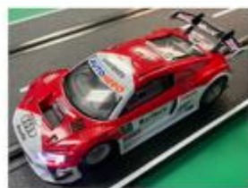
Audi R8 GT3