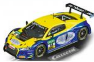
Audi R8 LMS "Twin Busch, No.44"