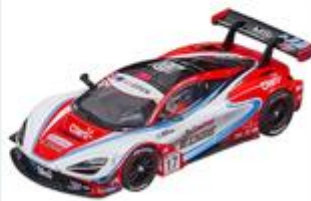
McLaren 720S GT3, No.17