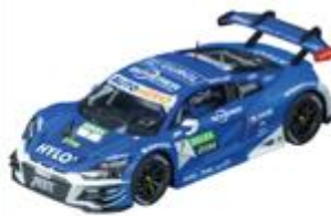
Audi R8 LMS GT3 Evo II Team ABT Sportsline No.7