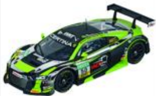
Audi R8 LMS Yaco Racing