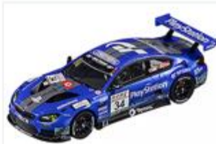
BMW M6 GT3 Walkenhorst No.34

New Bill Whitehouse 23' (N/A) - 24' (19.833)