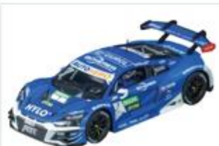
Audi R8 LMS GT3 Evo II Team ABT Sportsline No.7