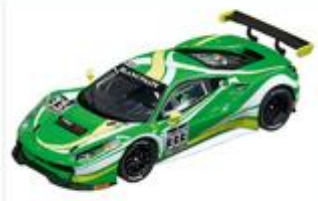
Ferrari 488 GT3 Rinaldi Racing No.333