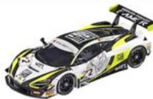
McLaren 720S GT3 Jenson Rocket Team JRN No.22