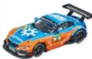
BMW Z4 GT3 GT3 Schubert Motorsport #20