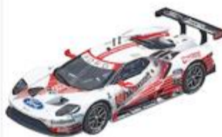
Ford GT No. 66