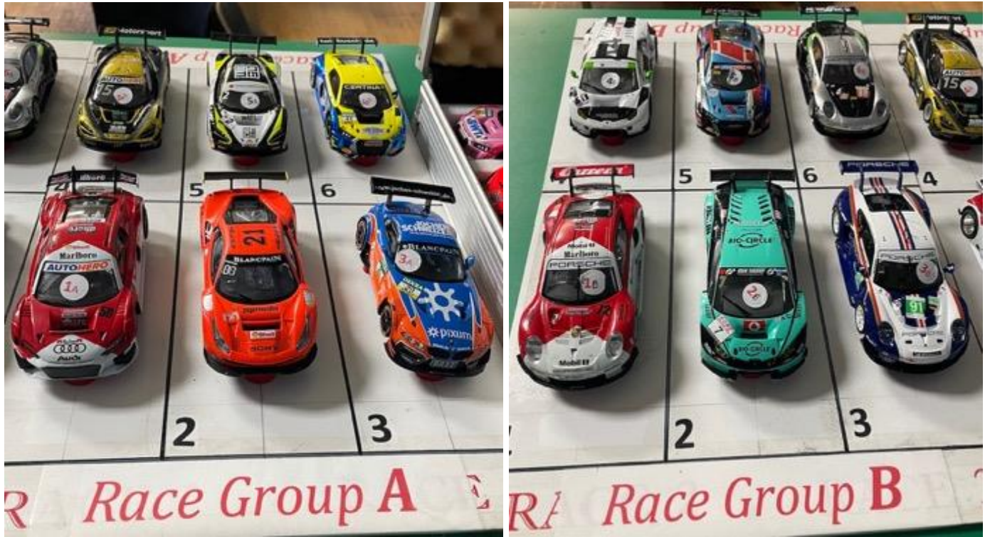
The four sets of cars for the Shanghai West Long circuit Test.