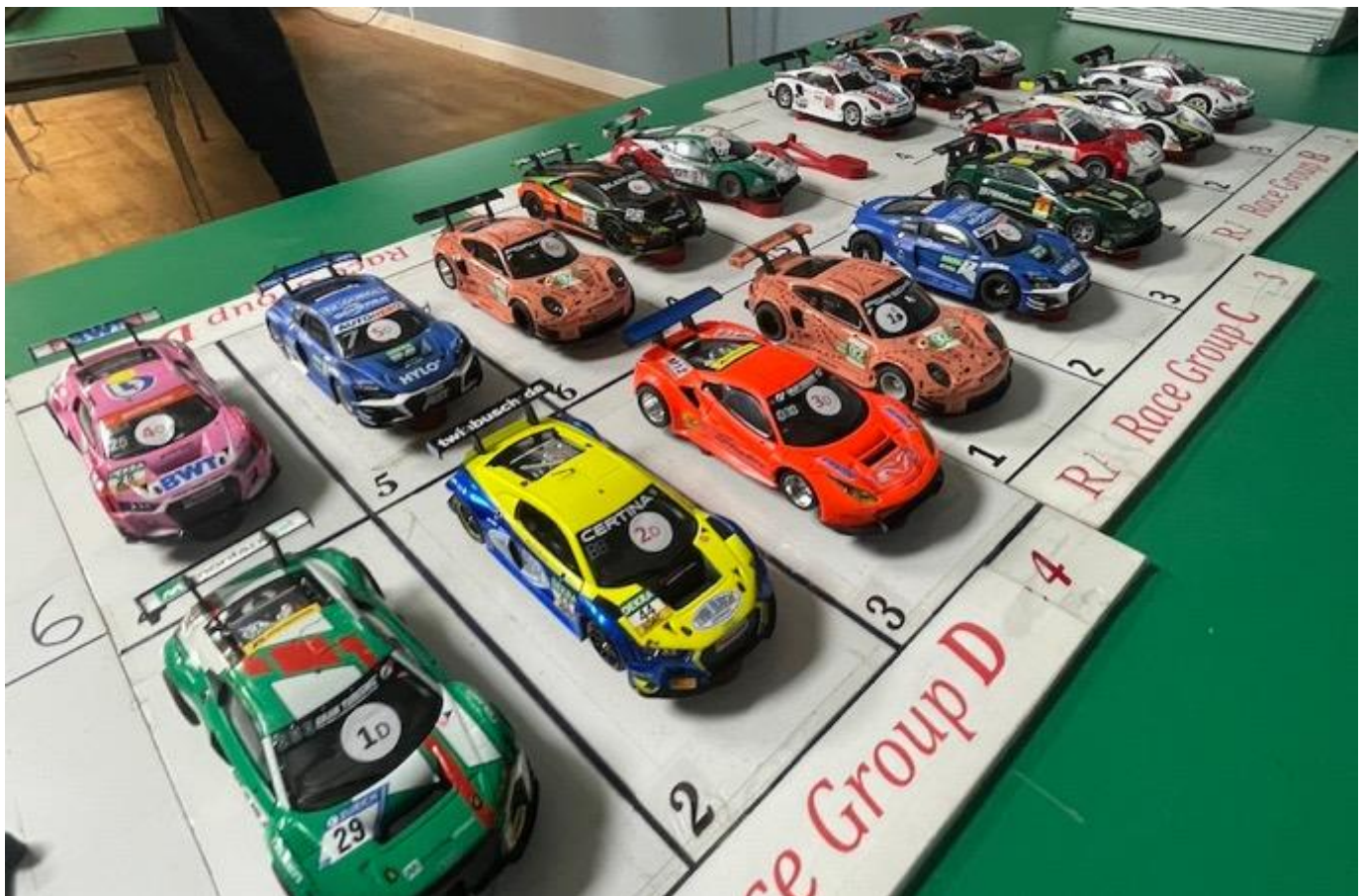
Some of the Parc Ferme cars