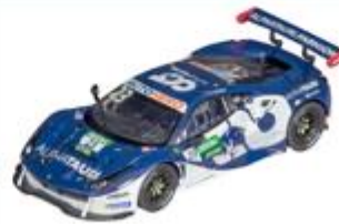
Ferrari 488 GT3 " Alpha Tauri Af Corse No. 23 DTM "