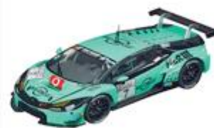
Lamborghini Huracan GT3 Konrad Motorsport No.7