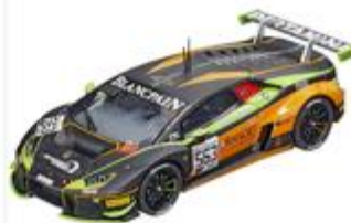
Lamborghini Huracan GT3 Orange1 FFF Racing No.563