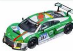
Audi R8 LMS #29 - '17 Nürburgring Winner

16 th ↓ 18 th Jag Kalyan 23' (12.926) +0.704 = 24' (13.630)