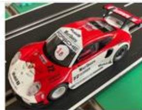
Porsche 911 RSR