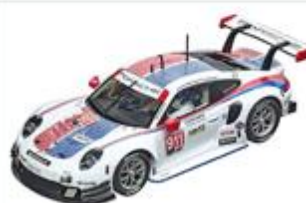
Porsche 911 RSR "Porsche GT Team, No.911"