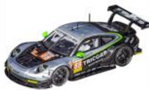
Porsche 911 RSR 'Proton Competition, No.88'