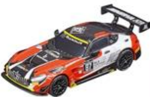
Mercedes-AMG GT3 Team AKKA-ASP, No.87