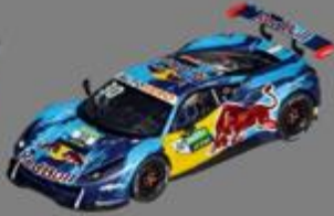
Ferrari - 23