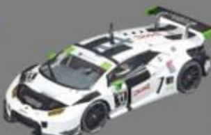
Lambo - 1