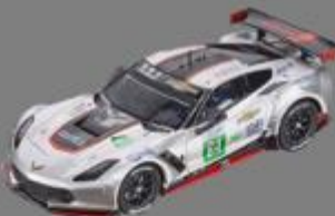
Corvette - 17