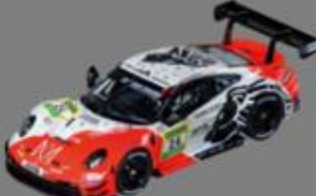
Porsche - 45