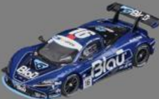
McLaren - 53