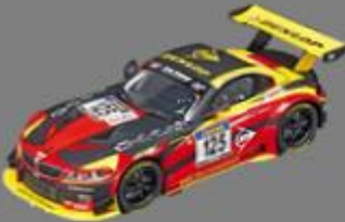
BMW - 22