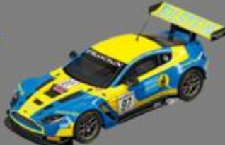
Aston - 1