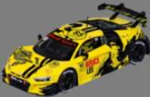
Audi - 57